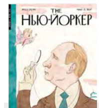
Series of Articles About Russia