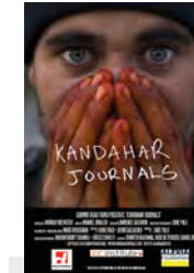
Louie Palu Class of 2013