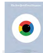
“The Great A.I. Awakening”