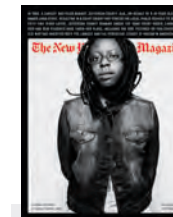
“The Resegregation of Jefferson County”