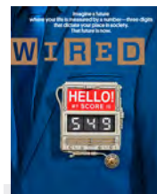
“Inside China's Vast New Experiment in Social Ranking”